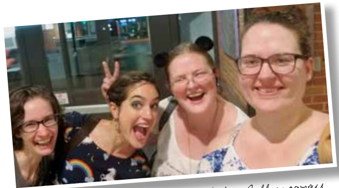
Reunited on the Stephens College campus