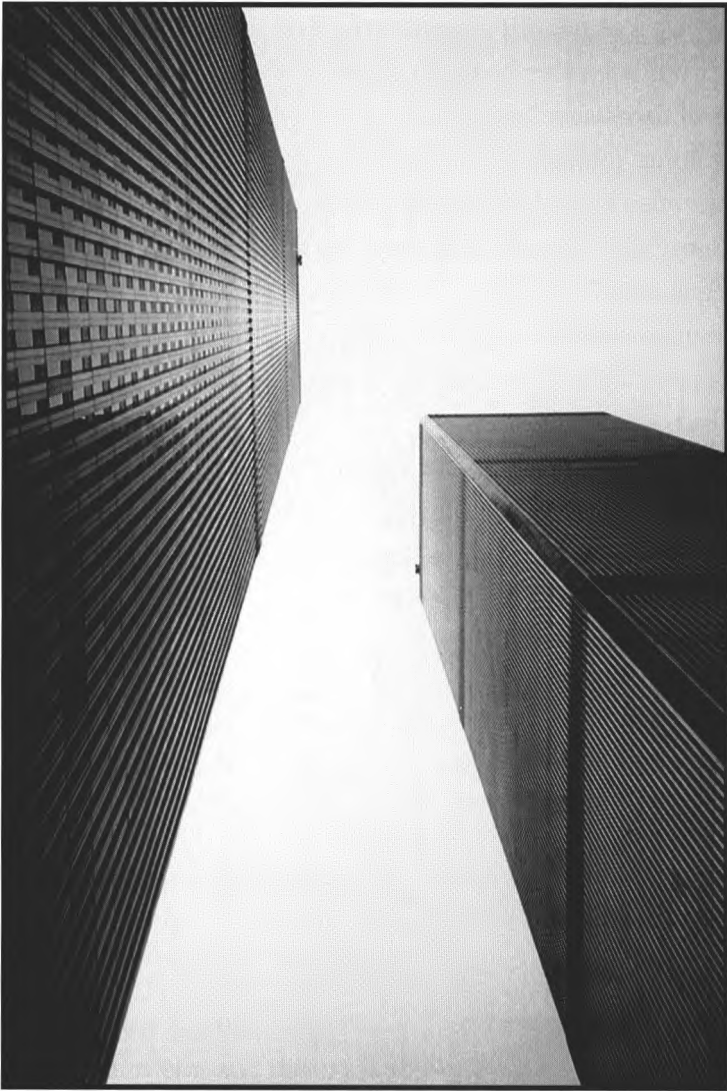
“Linear Beauty—Solemn Strength”